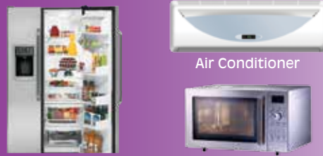
Refrigerator Air Conditioner Microwave Oven