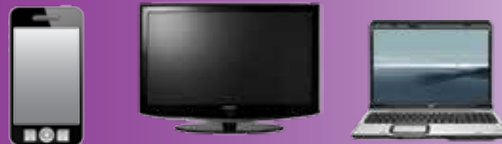
Mobile Phone Television Computer

Eneoji BioCerastone strongly advises you to use this on the following devices: